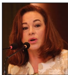
H.E. Ms. María Fernanda Espinosa Garcés President-Elect of the 73rd Session of the UN General Assembly.